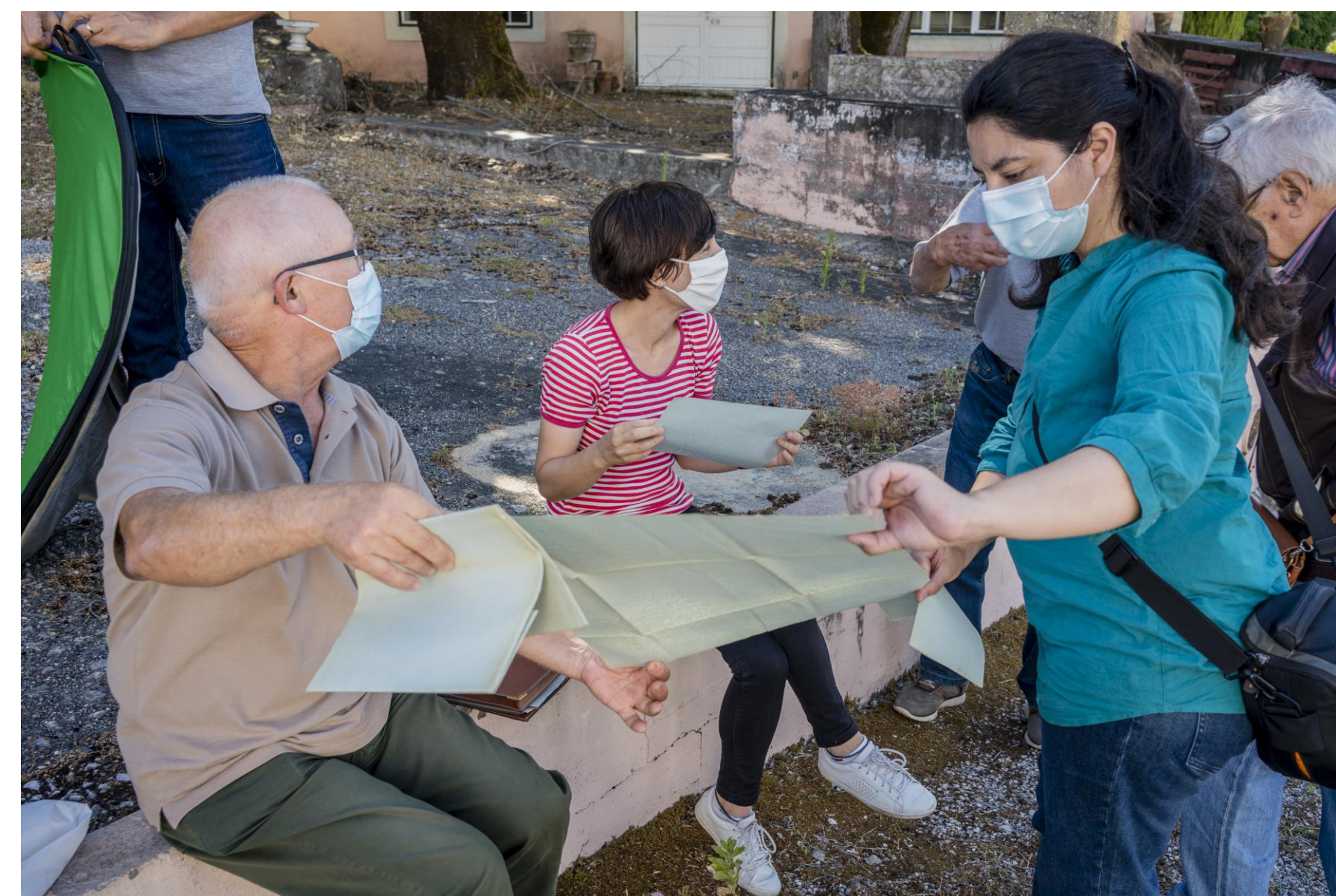
Checking paper samples with former workers at Fábrica de Papel do Prado