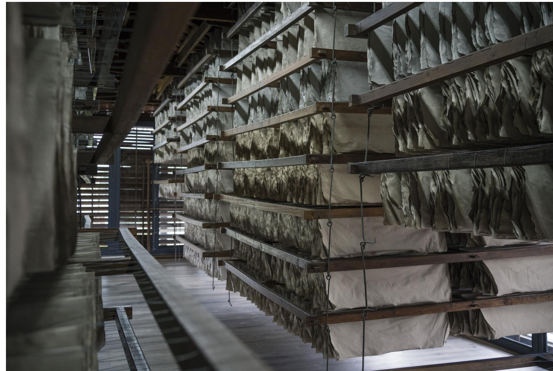
Field work, - Museum of Paper of Terras de Santa Maria

In addition, it assisted in, somehow, soothing the trauma of those who lost their jobs in the paper industry by exposing them to possible new prospects to their former workplaces.